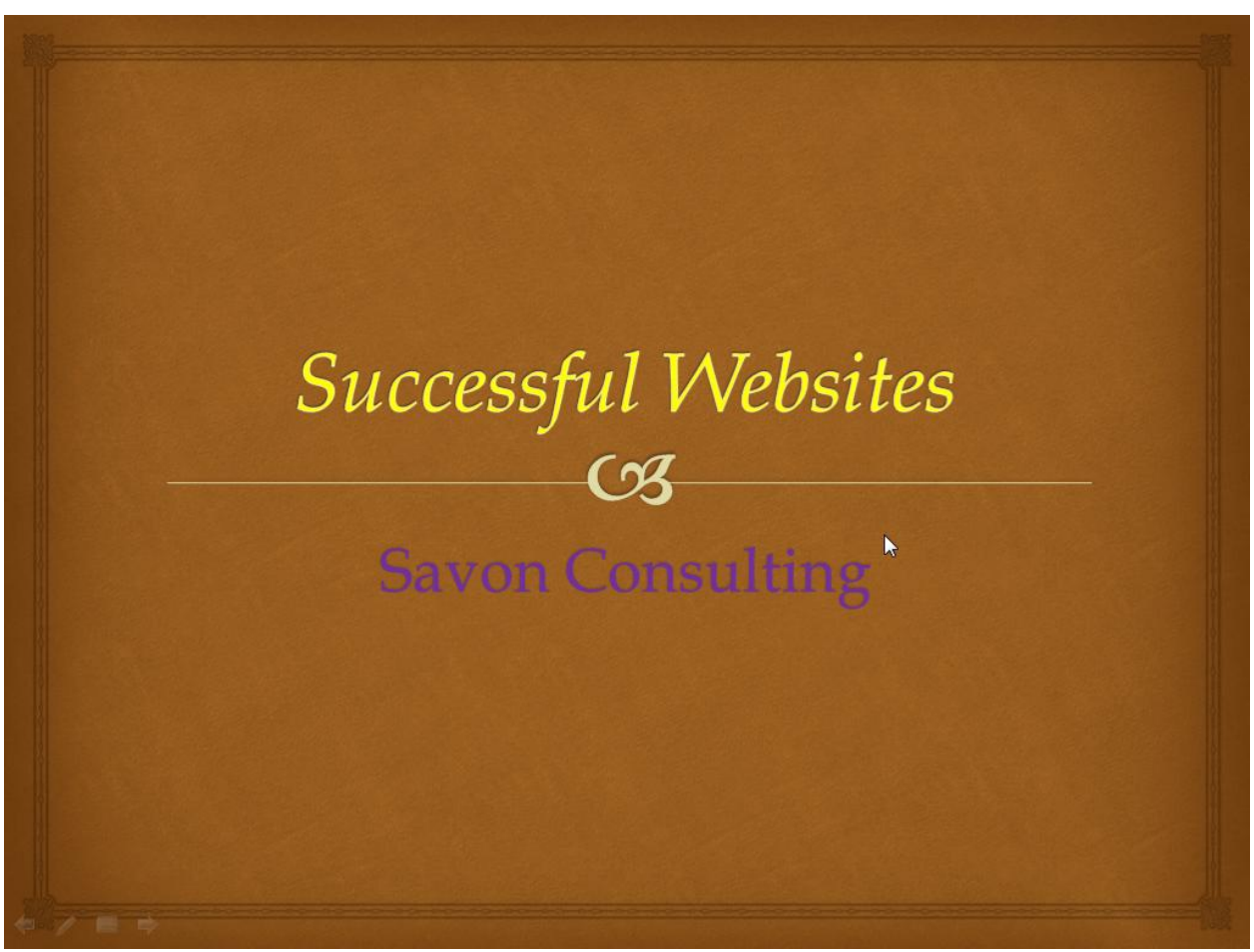
Figure PP1A – 2a