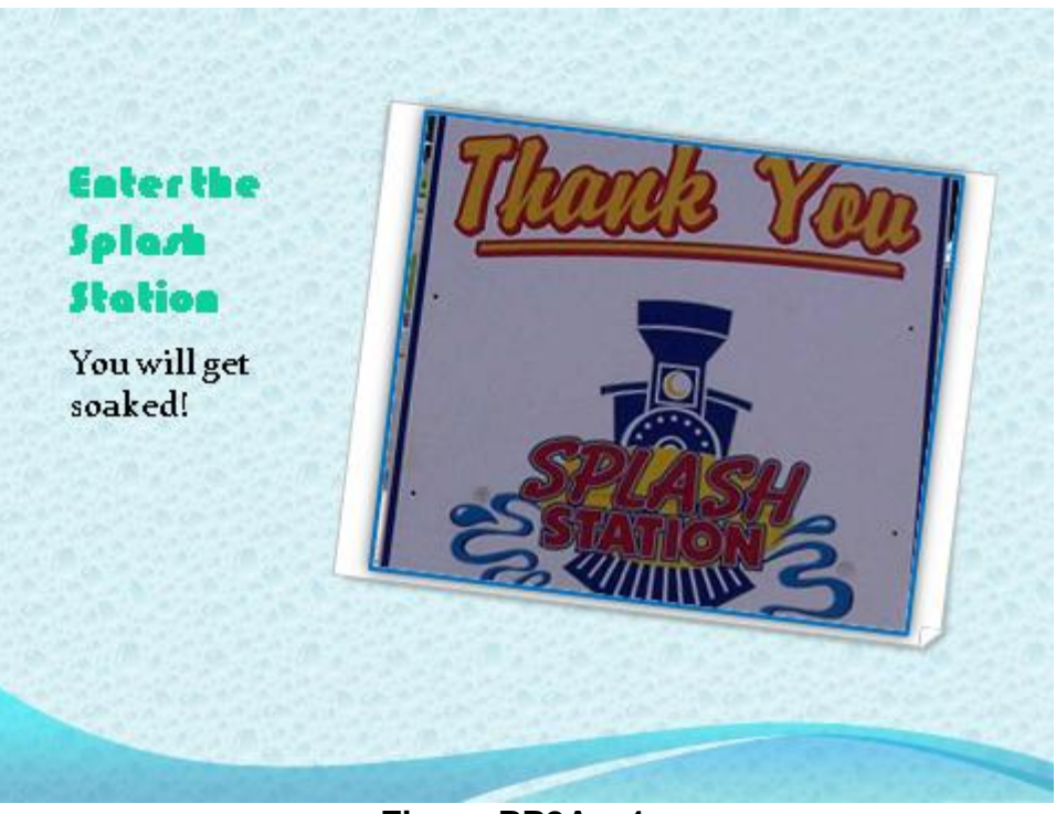
Figure PP2A – 1e