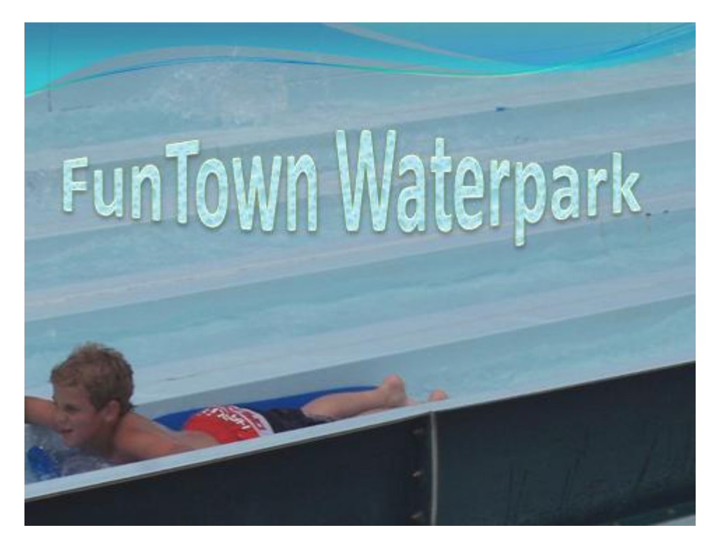
Figure PP2A – 1a