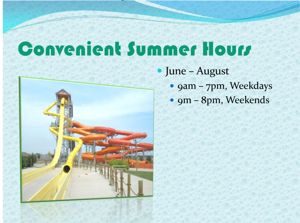
Figure PP2A – 1b