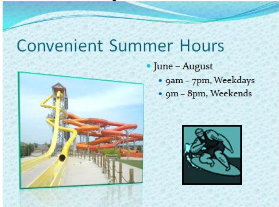
Figure PP2A – 1b