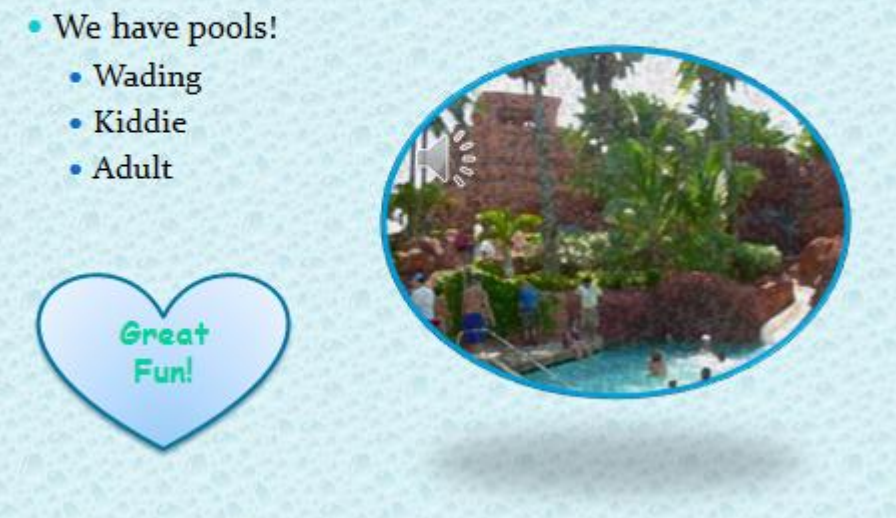
Figure PP2A – 1d