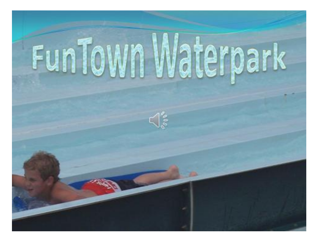
Figure PP2A – 1a