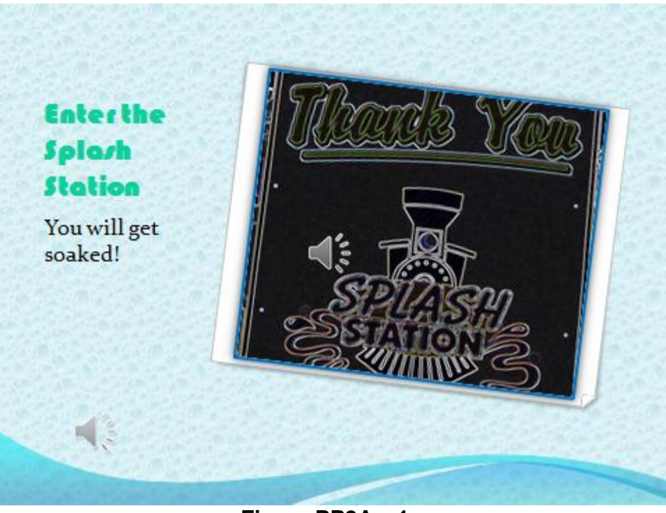
Figure PP2A – 1e